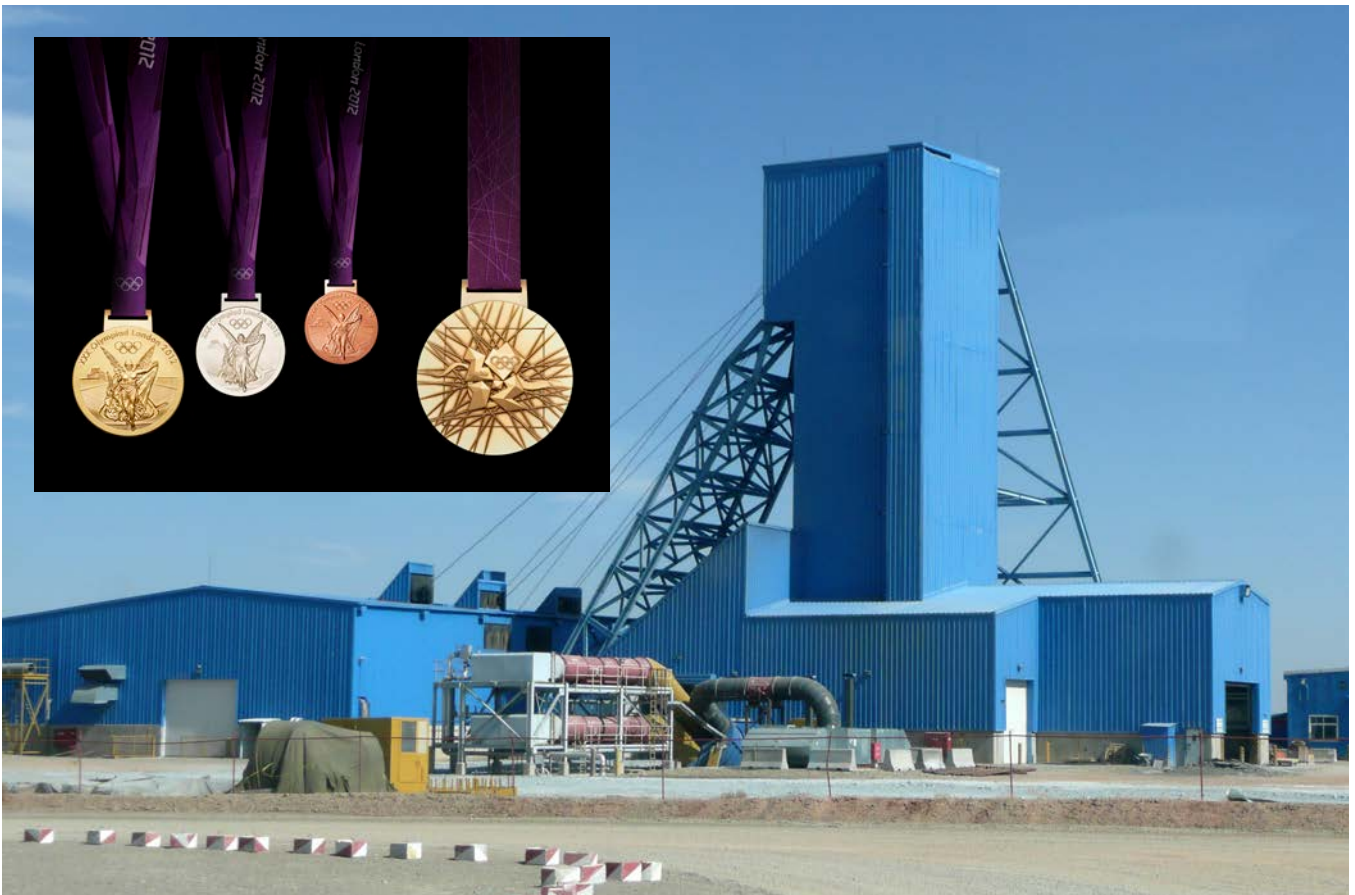
Oyu Tolgoi mine in Mongolia. Inset: London 2012 medals.