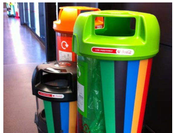
Bins at the Handball test event.

9.3 LOCOG is planning to have a three bin system for front of house areas and has been trialling this at the recent London Prepares test events. This comprises compostables, mixed dry recyclables and residual waste. These will be colour coded and clearly labelled with icons showing the types of products that can go in each bin. The Commission commends LOCOG for the work that is being done to get the packaging, bins, and recycling and composting methods aligned to enable their challenging waste targets to become achievable.