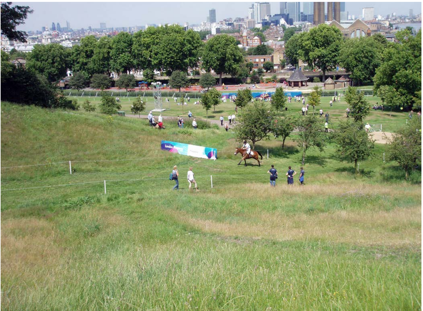
The equestrian test event in Greenwich Park.