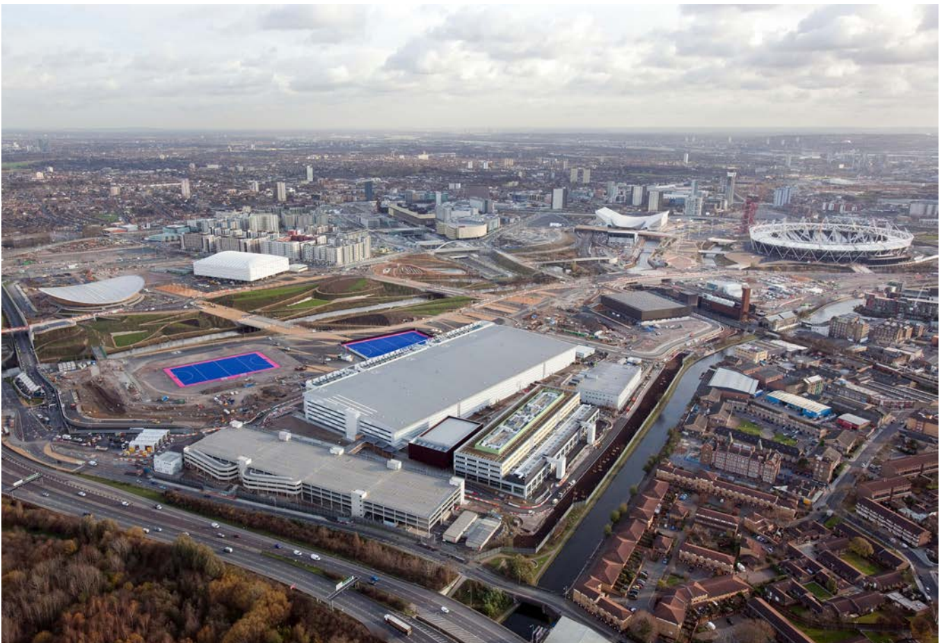
Aerial shot of the Olympic Park showing the Media Centre.