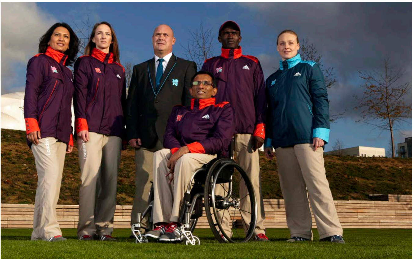
London 2012 volunteer uniforms. Copyright LOCOG / adidas